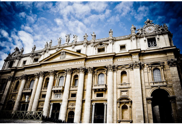
BASILICA OF ST. JOHN LATERAN