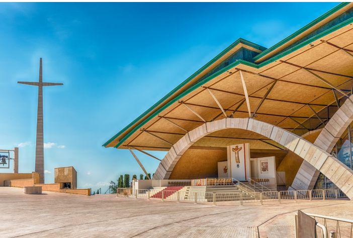
SAN GIOVANNI ROTONDO